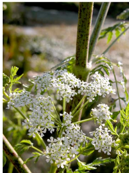
Poison Hemlock Conium maculatum Introduced Biennial Carrot Family