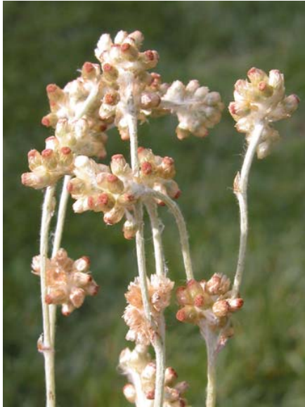
Weedy Cudweed Gnaphalium luteo-album Introduced Annual Sunflower Family