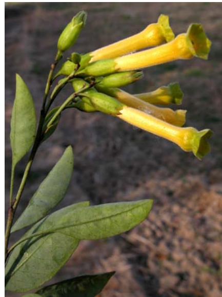
Tree Tobacco Nicotiana glauca Introduced Perennial Nightshade Family