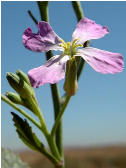
Wild Radish Raphanus sativus Introduced Annual Mustard Family