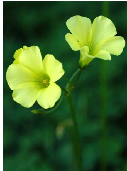
Bermuda Buttercup Oxalis pes-caprae Introduced Perennial Oxalis Family