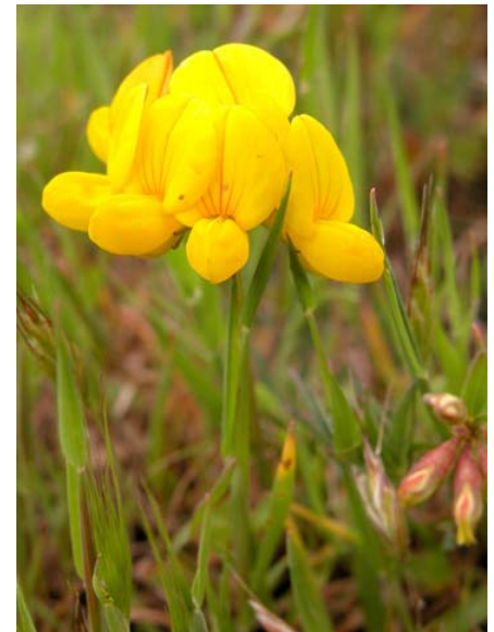
Bird's-foot Deerweed Lotus corniculatus Introduced Perennial Pea Family