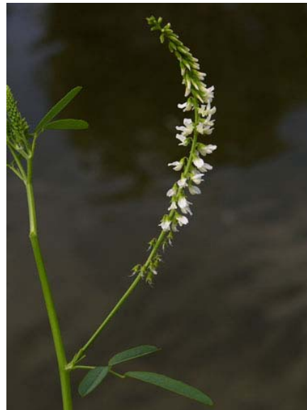
White Sweet Clover Melilotus alba Introduced Annual-Biennial Pea Family