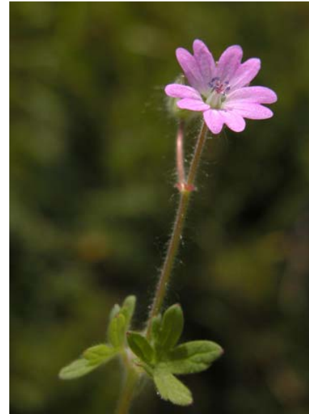
Hairy Dove's Foot Geranium Geranium molle Introduced Annual Geranium Family