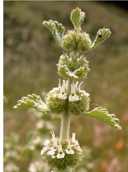
Common Horehound Marrubium vulgare Introduced Perennial Mint Family