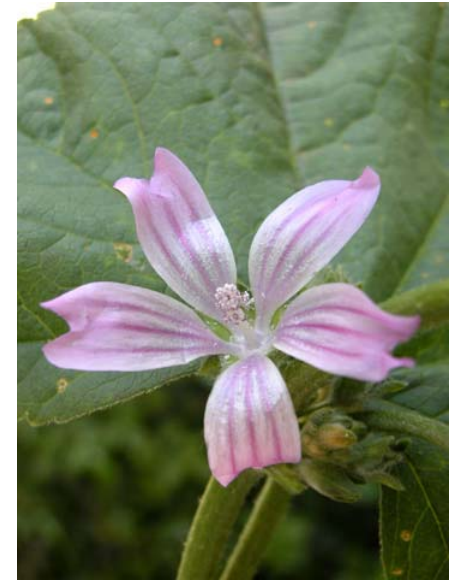
Bull Mallow Malva nicaeensis Introduced Annual Mallow Family