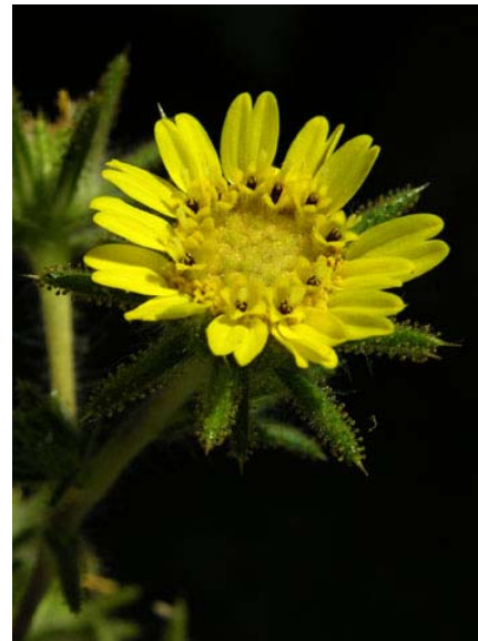
Fitch Spikeweed Hemizonia fitchii Native Perennial Sunflower Family