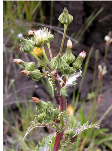
Prickly Sow Thistle Sonchus asper ssp. asper Introduced Annual Sunflower Family