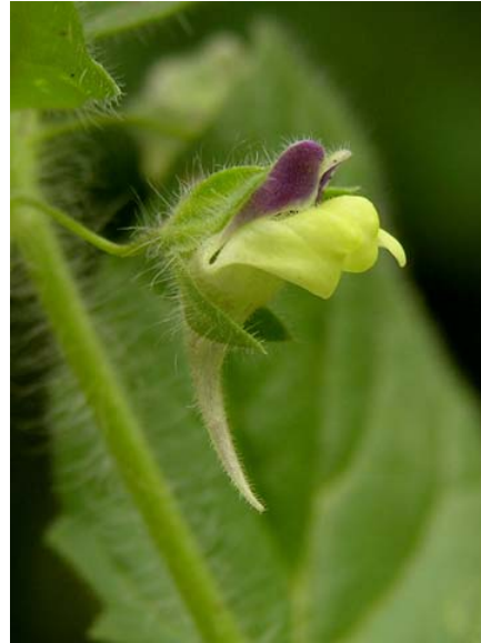
Sharp Point Fluvellin Kickxia elatine Introduced Annual Snapdragon Family