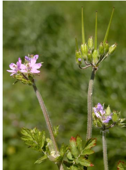
White-stem Filaree Erodium moschatum Introduced Annual Geranium Family