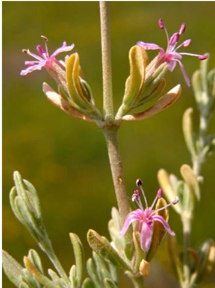
Alkali Heath Frankenia salina Native Perennial Frankenia Family