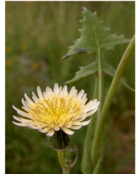
Common Sow Thistle Sonchus oleraceus Introduced Annual Sunflower Family