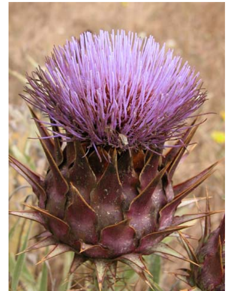
Cardoon / Artichoke Thistle Cynara cardunculus Introduced Perennial Sunflower Family