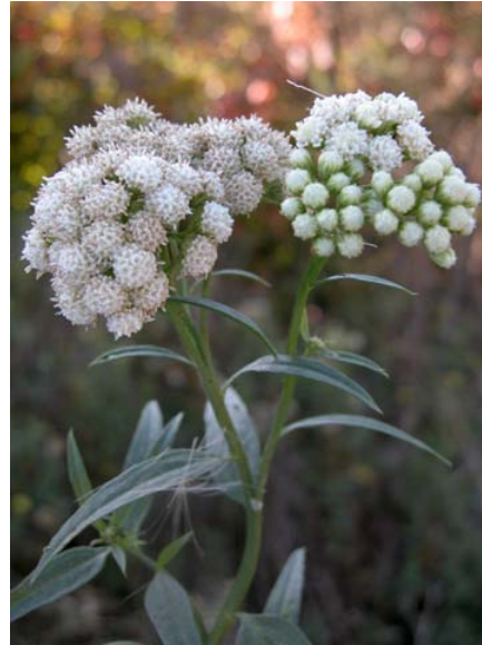
Douglas/Salt Marsh Baccharis Baccharis douglasii Native Perennial Sunflower Family