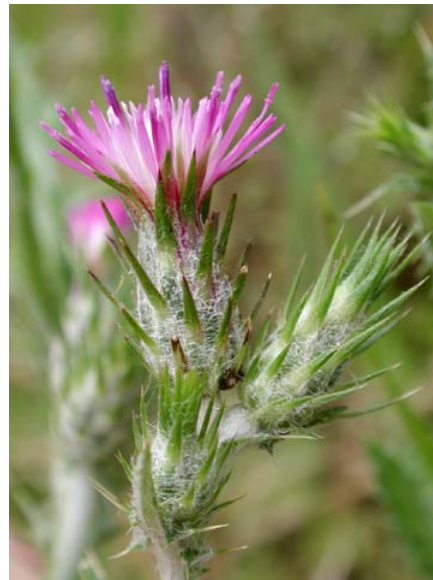
Italian Thistle Carduus pycnocephalus Introduced Annual Sunflower Family