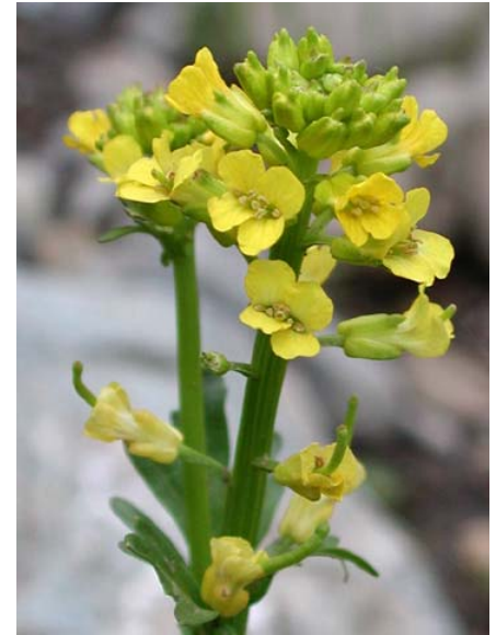
Erect-pod Winter Cress Barbarea orthoceras Native Perennial Mustard Family