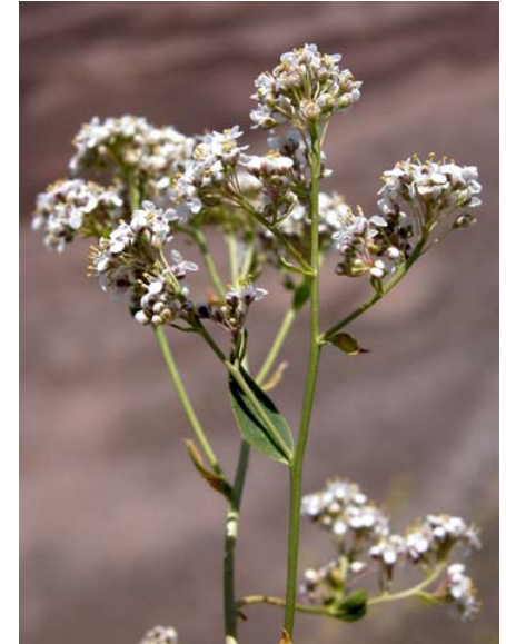
Slender Peren. Peppergrass Lepidium latifolium Introduced Perennial Mustard Family