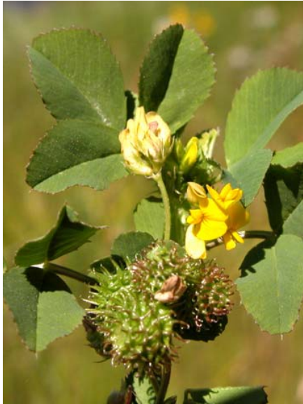
California Bur Clover Medicago polymorpha Introduced Annual Pea Family