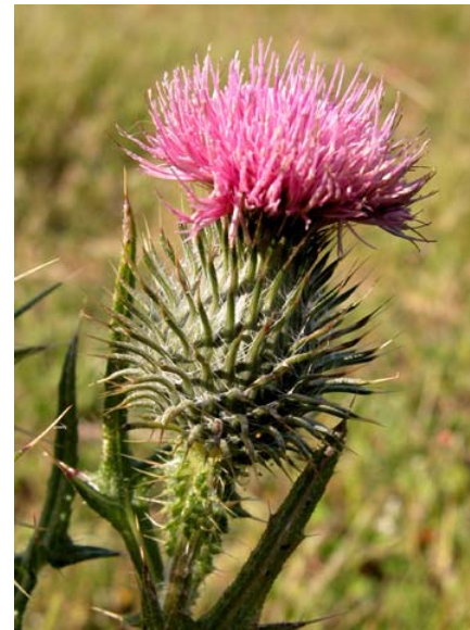
Bull Thistle Cirsium vulgare Introduced Biennial Sunflower Family