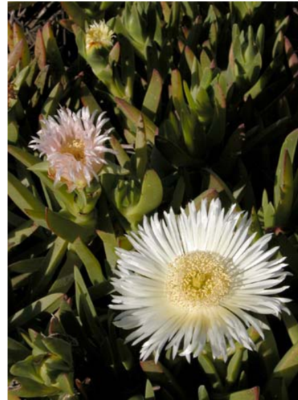
Yellow Hottentot Fig Carpobrotus edulis Introduced Perennial Fig-Marigold Family