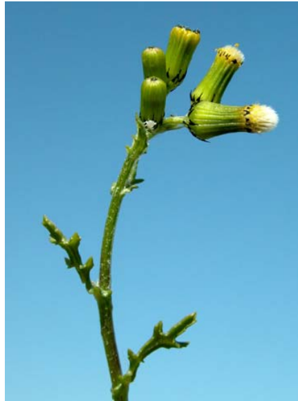
Common Groundsel Senecio vulgaris Introduced Annual Sunflower Family